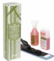
TORLYS Natural Glow® Eco-Friendly Cleaning Kit

In some installations, a separate underlay is required to meet impact sound ratings in high rise buildings or condos. For more information on all TORLYS underlays, visit www.torlys.com .