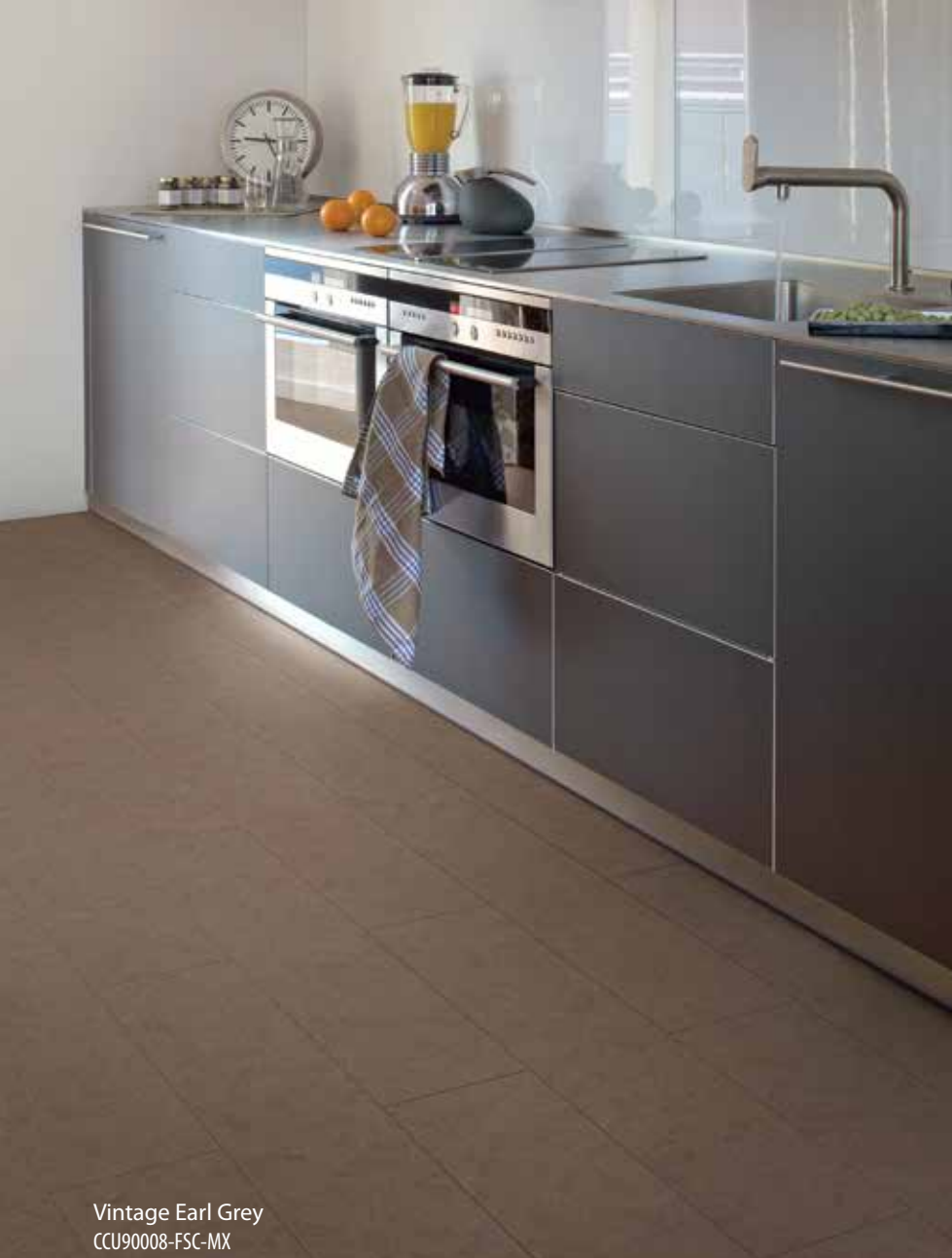
Vintage Earl Grey CCU90008-FSC-MX