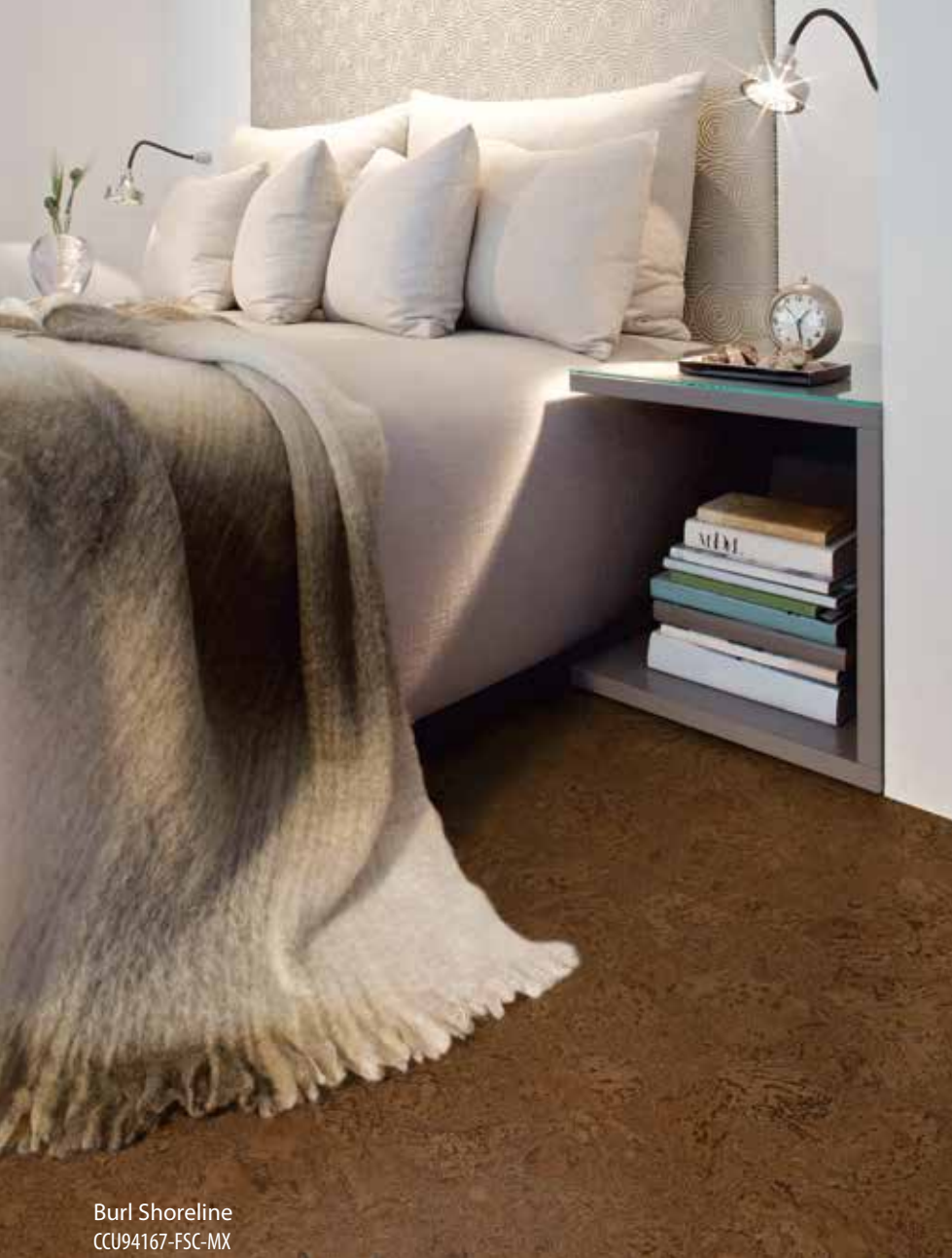
Burl Shoreline CCU94167-FSC-MX