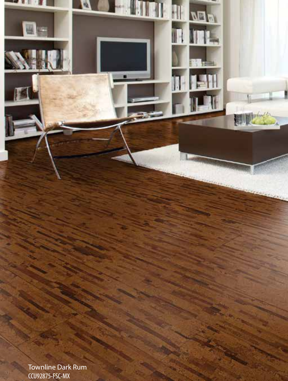
Townline Dark Rum CCU92875-FSC-MX